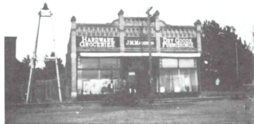
J.M. Maddison Store, early 1900's, showing on the left — Fire and Curfew Bell.