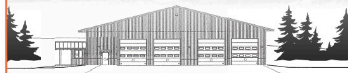
Our new facility will encompass 7,800 sq. ft.

Thank You for Supporting Our Capital Campaign to Build a New Fire Station and Engine House for our Community