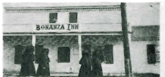
St. Mary's Hospital, Virginia City, Mont., 1875-1879 (after Sisters withdrew)—as it stands today