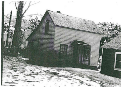
The House that housed the Nuns