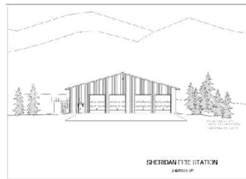
SHERIDAN FIRE STATION 148001417

Thank you for supporting our efforts to build a new Fire Station for your community. The facility will be located on our property at 3284 - A MT Hwy 287 - one mile south of Sheridan. The Board of Directors for the Sheridan Fire Department Rural District #4 and the Sheridan Firefighter Association are currently working on project details with our Architect and Engineering firm. Please call us if you would like more information on our progress!