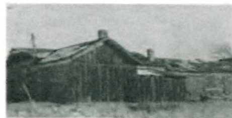
St. Mary's Hospital, Virginia City, Mont., 1875-1879 (after Sisters withdrew)—as it stands today