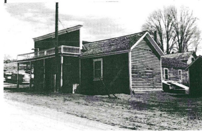
S. Mary's Hospital