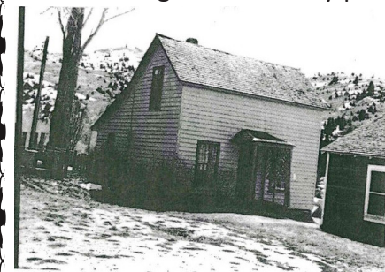
The House that housed the Nuns